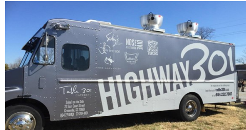
TABLE 301 FOOD TRUCK!